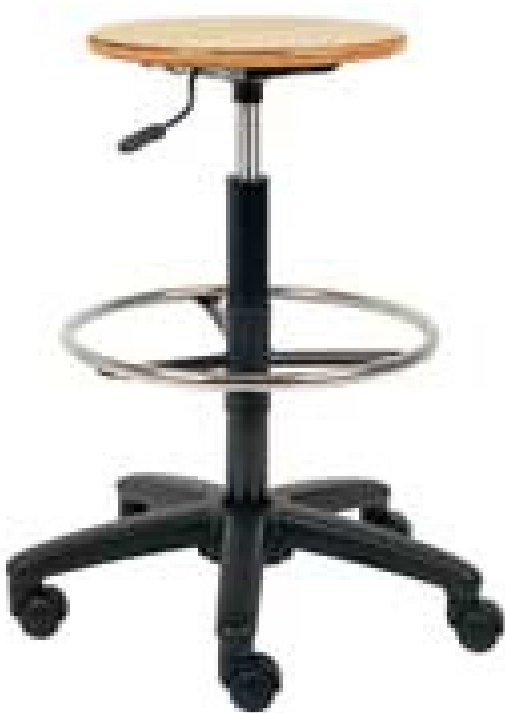
BLS02CW WOOD SEATED LAB STOOL WITH CASTORS