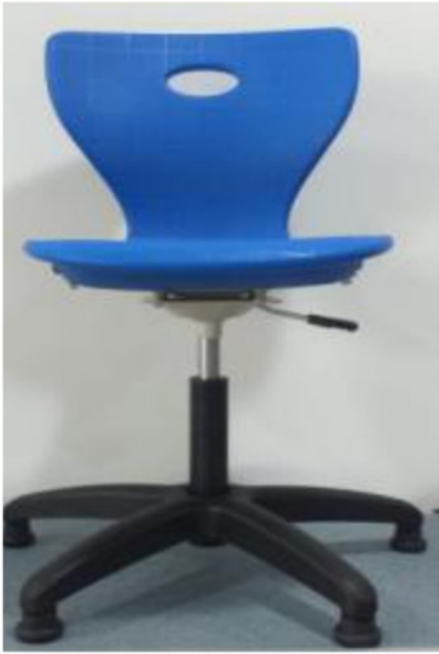
BLC04CW BLOW MOLDED SEATED LAB CHAIRL WITH CASTORS