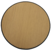
VENEERED WOOD SEAT - SELECTED WOOD FINISH