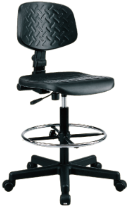
BLC01CW PU SEATED LAB CHAIR WITH CASTORS