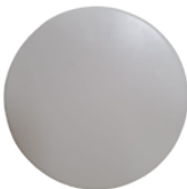
PU PAINTED FINISH - ANY RAL COULRS

Custom made Height Adjustable - threaded rod Heavy duty threaded rod for height adjustment Laminated / veneered / painted plywood for the seat MS Tube epoxy powder coated frame & foot ring Seat Height Range: 580~835mm Seat dia: 300mm Seat thickness: 24mm