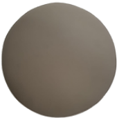
FOAM CUSHIONED SEAT - SELECTED COULRS