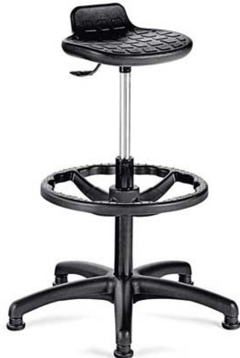
BLS01CW PU SEATED LAB STOOL WITH CASTORS